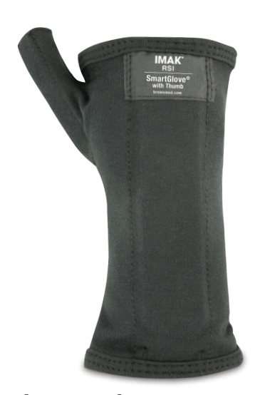
DESIGNED BY AN ORTHOPEDIC SURGEON