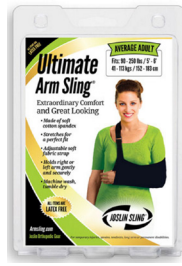
Average Adult #J50201CS

Fits 90-250 lbs / 5' - 6' tall 41-113 kgs / 152-183 cm tall