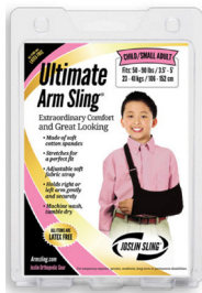
Child/Small Adult #J50101CS

Fits 50-90 lbs / 3'5" - 5' tall 23-41kgs / 106-152 cm tall