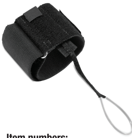
DESIGNED BY AN ORTHOPEDIC SPECIALIST