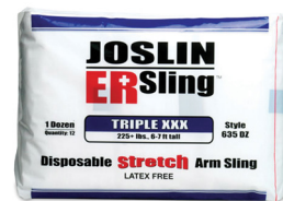
Triple XXX #J63538

Fits 90 - 250 lbs / 5' - 6' tall 41- 114 kgs / 152-183 cm tall