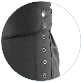
Detail of belt with snaps.